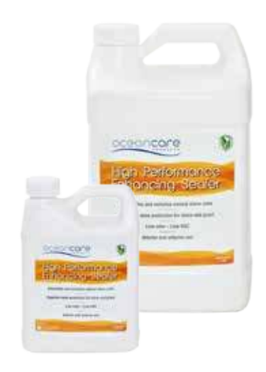
Available sizes / part number / coverage* Quart / OCG-37-4970 / 50-375 sq. ft. Gallon / OCG-37-4971 / 200-1500 sq. ft.

A low VOC, all-in-one color enhancer and penetrating sealer for both interior and exterior applications. Intensifies and enriches the color of natural stone, grout, concrete and other porous masonry materials. Forms a barrier that is resistant to water and oil and provides superior stain protection.