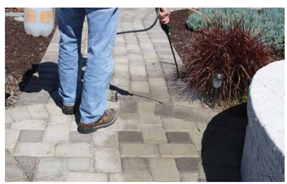
*Actual coverages may vary depending on surface texture, porosity and rate of application