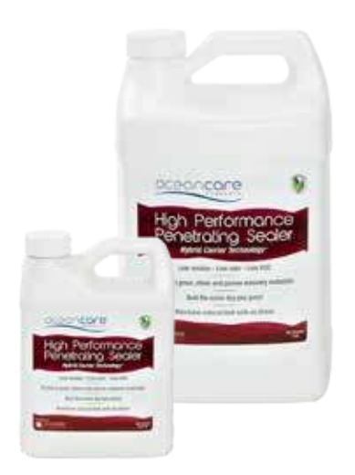
Available sizes / part number / coverage* Quart / OCG-50-0004 / 125-625 sq. ft. Gallon / OCG-50-0005 / 500-2500 sq. ft.

Penetrates and protects grout, natural stone and other porous masonry materials. Forms an invisible, no-sheen barrier that is resistant to water and oil and provides superior stain protection. Low residue formula is specifically designed to be easier and faster to apply than traditional penetrating sealers. May be applied to dry, damp, cured or uncured grout or natural stone (seriously...immediately after grouting!).